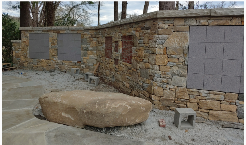
MEMORIAL GARDEN WALL WITH NICHEs

Your final resting place can be at Good Shepherd!