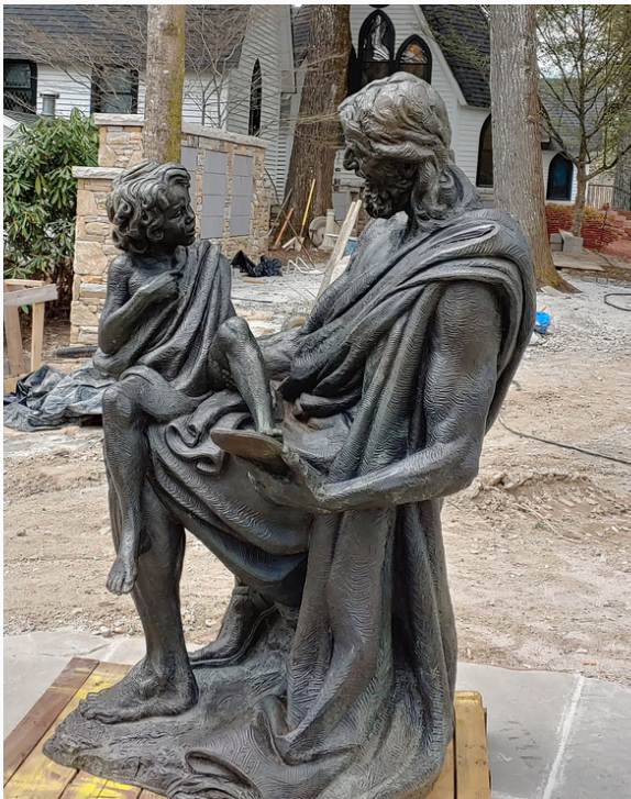
"CHOSEN", A SCULPTURE OF JESUS AND CHILD BY WESLEY WOFFORD