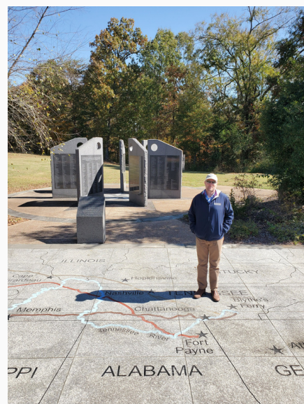
At Blythe's Ferry: The Cherokee Removal Memorial